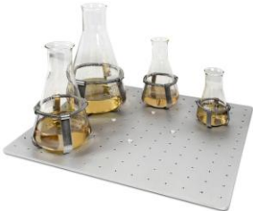
UP-168 and HSC clamps