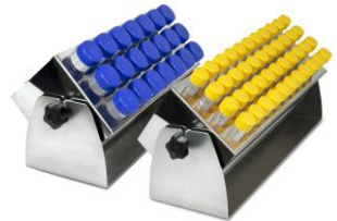
TR-21/50 and TR-44/15