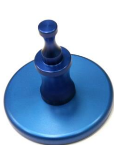
1. Rotor stand