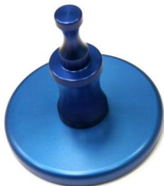
1. Rotor stand