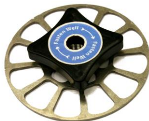
3. Rotor lid