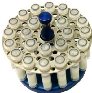
2. Rotor Figure 1.