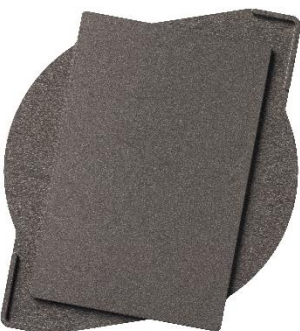
Freeze plate 05 Matrix Tube (SLAS Microplate)