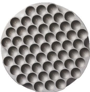
Freeze plate 02 Cryovial