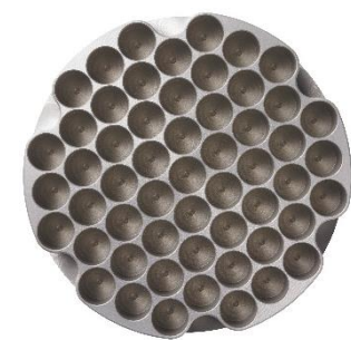
Freeze plate 06 Cryovial