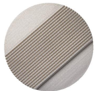
Freeze plate 01 IMV Straw