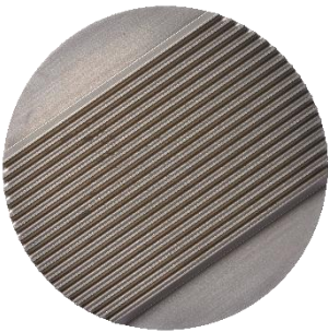
Freeze plate 00 IMV Straw

The freezing and thawing rate is precisely controlled, ensuring accuracy and reproducibility throughout the freezing and thawing profiles, especially for the important nucleation/seeding phase. This provides optimal recovery of cells on thawing. Operation is simple and can be carried out with or without a PC; data can be logged via PC software and profiles are directly displayed on PC screen. Different freezing profiles are available from a drop-down menu and customised profiles can be designed through the software editing suite.