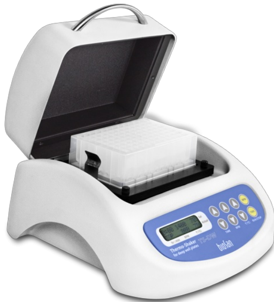
TS-DW Without thermoblock Thermo-Shaker for deep well plates

TS-DW Thermo-Shaker is designed for shaking and incubating deep well plates.