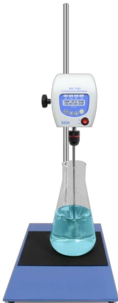
MM-1000 Without stirrer Overhead Stirrer Multi Mixer