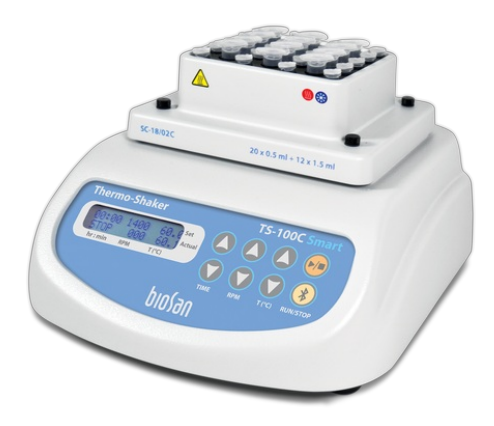
TS-100C Smart Software included, without thermoblock Thermo-Shaker with cooling for microtubes and PCR plates

Without thermoblock Thermo-Shaker with cooling for microtubes and PCR plates