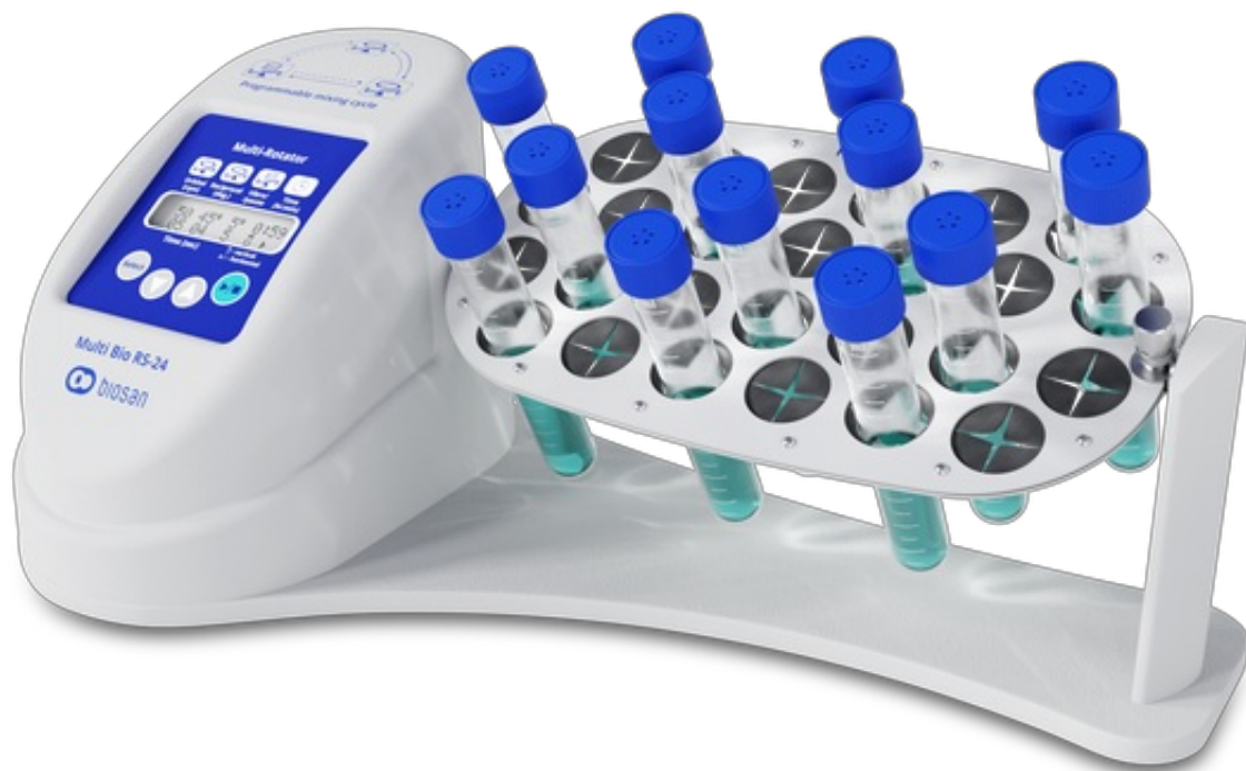
Multi Bio RS-24 Including PRS-26 platform Programmable rotator