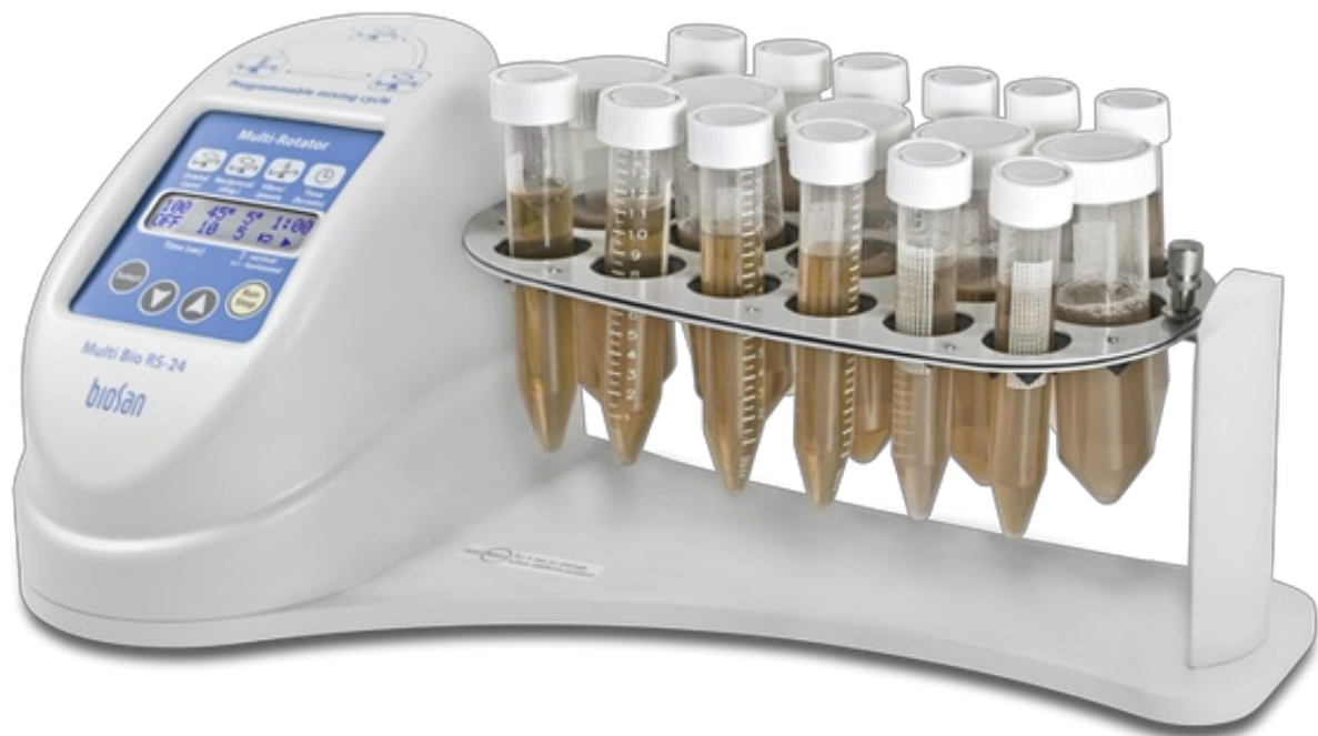
Multi Bio RS-24 Including PRS-26 platform Programmable rotator