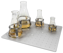
UP-168 BS-010135-JK platform

Universal platform with clamps can accommodate flasks or bottles of different volume sizes. Clamps are not included with platform and need to be ordered separately.