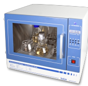
ES-20/60 Without platform Orbital Shaker-Incubator