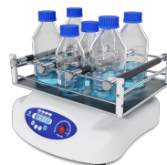
PSU-20i Without platform Multifunctional Orbital Shaker