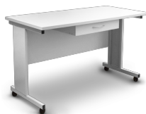
T-4L BS-040107-BK Table

New modular design of laboratory furniture provides flexibility and ease of use.