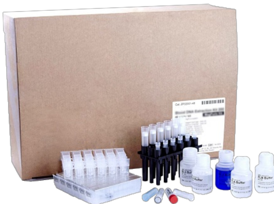
Reagents for BioMagPure 12 Plus BS-060201-AK