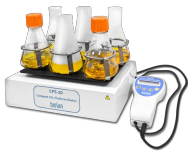
CPS-20 Without platform CO 2 Shaker