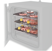
RS6 BS-010425-GK rack with 3 shelves Rack with 3 shelves