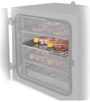
Additional shelf BS-010425-AK