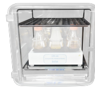
RS2 BS-010425-HK rack for CPS-20 / CTR-6 installation Rack for CPS-20 / CTR-6 installation