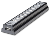
USB 2.0 Hub 10 × ports BS-010158-BK