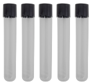
Glass test tubes 16mm BS-050102-MK

Glass Test Tubes 16x100mm, high borosilicate, PP Cap with silicone pad. Packing - 100 pcs/box