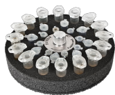
SV-16/8 BS-010210-CK platform

16/8/8 sockets for 1.5/0.5/0.2 ml microtest tubes (Ø 11/8/6 mm).