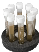
SV-8/15 BS-010210-DK platform