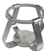
FC-500 BS-010126-LK clamp