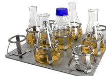
P-9/500 BS-010135-AK platform