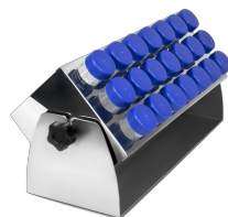
TR-21/50 BS-010135-KK rack

Adjustable angle test tube rack for UP-168