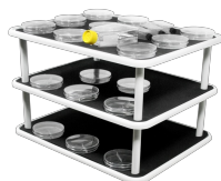
PP-20/3 BS-010126-BK platform

Flat platform with non-slip rubber mat can accommodate various low profile containers.