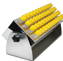
TR-44/15 BS-010135-LK rack

Double-sided adhesive strips. SPML is compatible with UP-168 platform, that fits both on PSU-20i orbital shaker and in ES-20/60, ES-20/80 Shakers-Incubators.