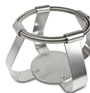
FC-1000 BS-010126-IK clamp