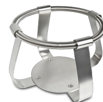
FC-2000 BS-010126-NK clamp

Clamp 2000 ml - Ø165 mm for UP-168 Max. - 200 rpm