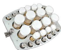
PRS-8/22 BS-010118-AK platform

48 tubes 10-16 mm diameter (1.5 ml-15 ml tubes).