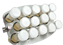
PRS-14 BS-010118-BK platform

14 tubes 20-30 mm diameter (50 ml tubes).