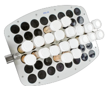
PRS-48 BS-010118-CK platform

14 tubes 20-30 mm diameter (50 ml tubes).