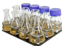
P-12/100 BS-010108-EK platform

Flat platform with non-slip silicone mat for Petri dishes, culture flasks, agglutination cards.