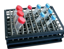
P-16/88 BS-010116-BK platform

Platform with spring holders for up to 88 tubes up to 30 mm diameter (e. g. 10 ml, 15 ml, 50 ml tubes).