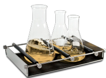
UP-12 BS-010108-AK platform

Universal platform with adjustable bars for different types of flasks, bottles, and beakers with silicone mat.