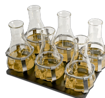
P-6/250 BS-010108-DK platform