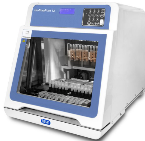
BioMagPure 12 BS-060201-AAA

Compact Bench-Top Robotic Workstation For Automated Nucleic Acid Purification