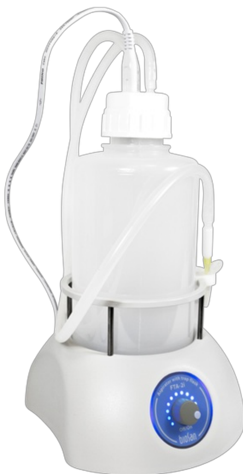
FTA-2i BS-040120-A02 Aspirator with Trap Flask

Aspirator with trap flask FTA-2i is designed for aspiration or removal of alcohol, buffer and liquid from reaction vessels (e.g. during DNA/RNA purification or other macromolecule reprecipitation techniques).