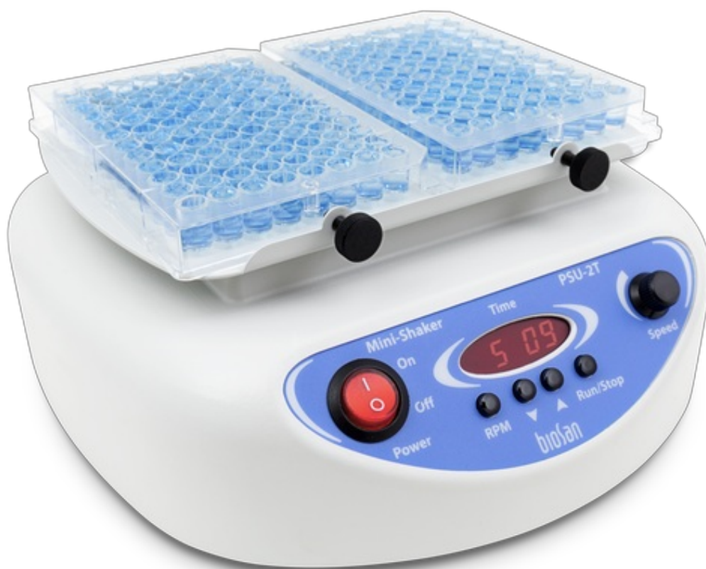
PSU-2T Including IPP-2 platform Mini-shaker for immunology

Mini-Shaker PSU-2T is designed for immunoassays and provides adjustable mixing of reagents in microplates. The device ensures smooth movement of the platform even at low speeds.