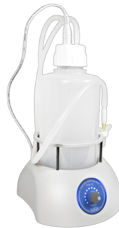
FTA-2i BS-040120-A02 Aspirator with Trap Flask

Aspirator with trap flask FTA-2i is designed for aspiration or removal of alcohol, buffer and liquid from reaction vessels (e.g. during DNA/RNA purification or other macromolecule reprecipitation techniques).