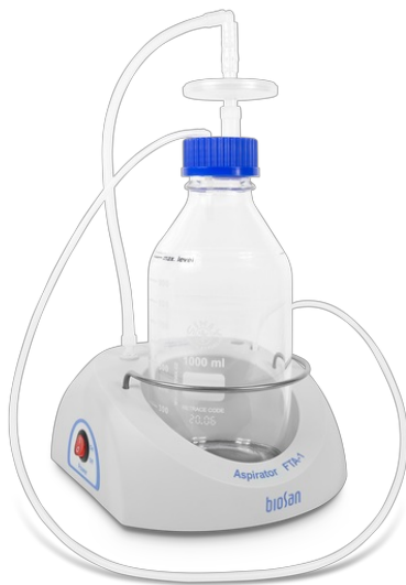
FTA-1 BS-040108-AAG Aspirator with trap flask

Aspirator with trap flask FTA-1 is designed for aspiration/removal of alcohol/buffer remaining quantities from microtest tube walls during DNA/RNA purification and other macromolecule reprecipitation techniques.