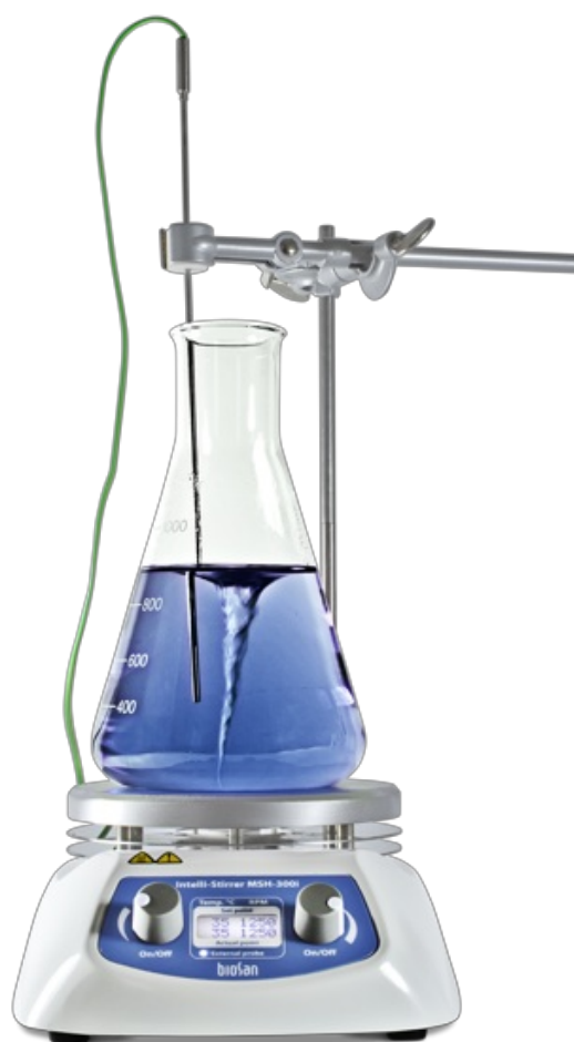
Intelli-Stirrer MSH-300i BS-010309-AAA Magnetic Stirrer with hot plate