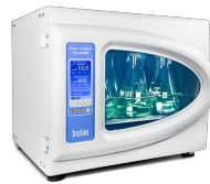
ES-20/80C Software included, without platform Orbital Shaker-Incubator with cooling