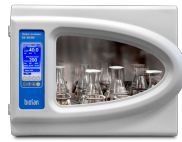
ES-20/80 Software included, without platform Orbital Shaker-Incubator

Universal platform with clamps can accommodate flasks or bottles of different volume sizes. Clamps are not included with platform and need to be ordered separately.