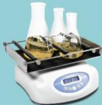
PSU-10i, Orbital Shaker

Applications: • Microbiology • Extraction • Cell cultivation