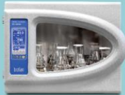
ES-20/80, Orbital Shaker-Incubator

Applications: • Microbiology • Extraction • Cell cultivation