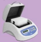
TS-DW, Thermo-Shaker for deep well plates

Applications: • ELISA Analysis • Genomic Analysis • Hybridization • Immunology