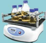
PSU-20i, Orbital Shaker