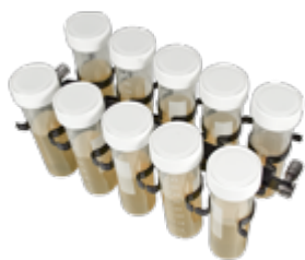
PRSC-10 10 tubes 25-30 mm diameter (50 ml tubes)