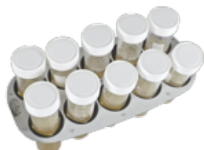
PRS-10 10 tubes 20-30 mm diameter (up to 50 ml tubes)