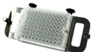
PRS-1DP Platform for microplates and racks for tall tubes 0.5 and 1 ml (e.g. Thermo 3741MTX, 3742MTX, 3744MTX)