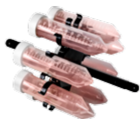
M-8/50 roller platform, 8 tubes 25-30 mm diameter (50 ml tubes). Application: hybridization reactions.