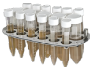
PRS-5/12 5 tubes 20-30 mm diameter (50 ml tubes) and 12 tubes 10-16 mm diameter (1.5-15 ml tubes)