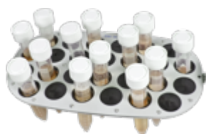
PRS-26 can accommodate 26 tubes 10-16 mm diameter (1.5-15 ml)