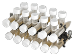
PRSC-22 can accommodate 22 tubes 16 mm diameter (15 ml)